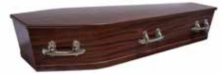
Mahogany Flat Lid