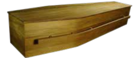
Archtype Silver Beech