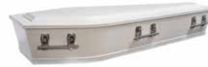
Painted White Raised Lid

Environmental considerations include material choice, assembly options, handles, finishes, and using less material to make the caskets.