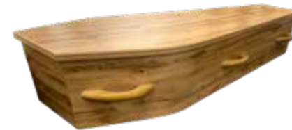
Light Oak Flat Lid