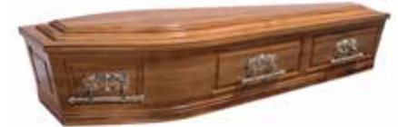
Solid Rimu Panelled