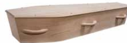
Pine Flat Lid