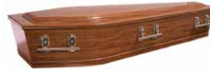
Rimu Raised Lid