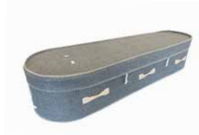
Grey Woollen Casket