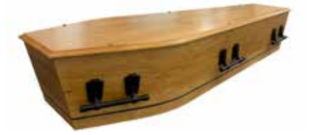
Flat Lid Solid Pine, Teak