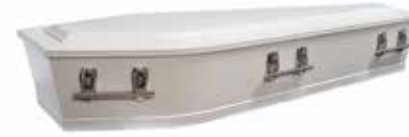
Painted White Raised Lid

Environmental considerations include material choice, assembly options, handles, finishes, and using less material to make the caskets.