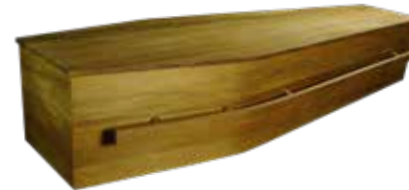
Archtype Silver Beech