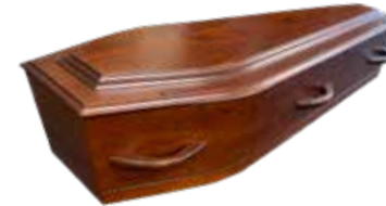
Raised Lid Solid Pine, Mahogany